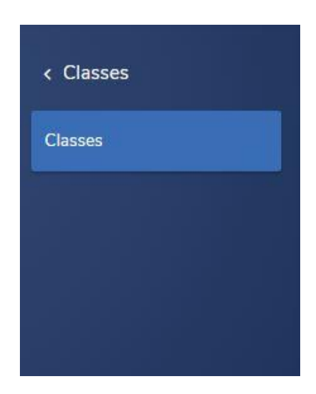
Step 6: Your student's schedule will be provided

Step 5: Select "Classes" (2 times) from the menu on the left side of the screen